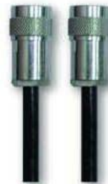
Direct probe with double N coaxial connector