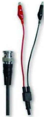
Cable with BNC connector and alligators