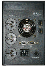
DS 1400 DS 2000