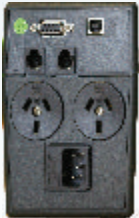
DS 600-DS 800