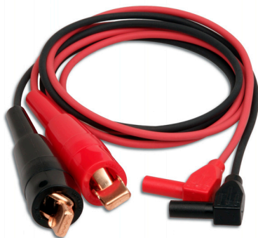
LSC-MBTLA2 (standard on MBT-LA2)