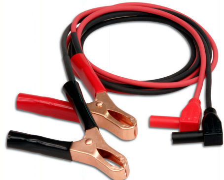
LSP-MBTLA2 (ideal for large batteries)