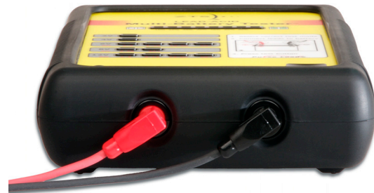
48" interchangeable test leads