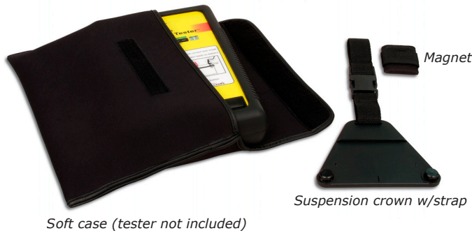
Soft case (tester not included)