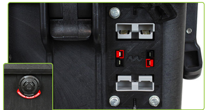
(1) This battery module comes supplied with Victron IP67 12.8V-25A Charger. (2) All outputs protected with resettable fuses.