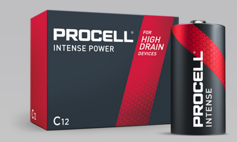
PROCELL INTENSE POWER ALKALINE C 12CT [ PX1400 ]