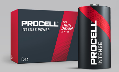
PROCELL INTENSE POWER ALKALINE D 12CT [ PX1300 ]