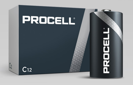
PROCELL ALKALINE C 12CT [ PC1400 ]