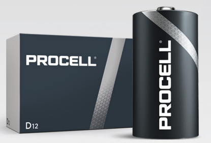
PROCELL ALKALINE D 12CT [ PC1300 ]