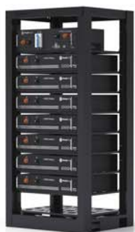
Powercube-X series 144-336V