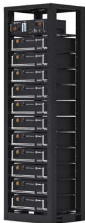
Powercube-H series 240-720V