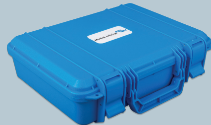
Carry Case for Blue Smart IP65 Chargers and accessories